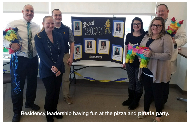
Residency leadership having fun at the pizza and piñata party.

The Residency revealed its incoming intern class through a Pizza & Piñata party in March (see next page for reveal).