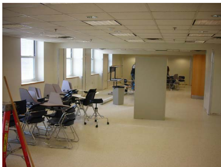
New Neuro/Peds Lab undergoing the final phase of construction (will contain 10 hi/low-mat tables)