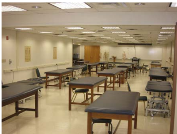
Renovated Musculoskeletal/Orthopedic Lab

The Division is undergoing some exciting changes. Starting with the Class of 2013 (cohort started classes June, 2010) the Division will accept 40 students per year. To support the increase in class size from 30 to 40 students, the School of Medicine has invested $225,000 in new lab space and new teaching equipment. We also plan to hire an additional faculty member. The 8 th floor plinth lab was expanded to allow for six additional treatment tables and merged the classroom with the lab. We also added a new 1,300 sq-ft Neuro/Peds lab on the 8 th floor, which will have 10 high low mat tables. The facilities expansion will free up the existing 3 rd floor lab to become dedicated clinic and research space. Capital equipment will include new high/low treatment/mat tables, ice machine, and modality units. Small teaching equipment will include items such as dumbbells, cuff weights, Swiss balls, and functional training equipment. The program expansion is designed to help fill State and National demand for physical therapists. In addition to the facility changes, the curriculum will also undergo some slight modifications. The primary curricular changes will include the restructuring of clinical education experiences to increase clinical site availability.