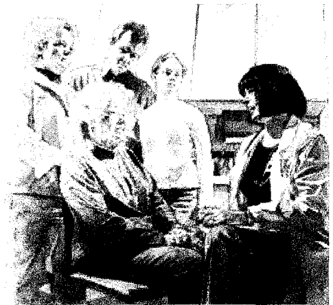
ILLUSTRATION BY MARK SCHULER