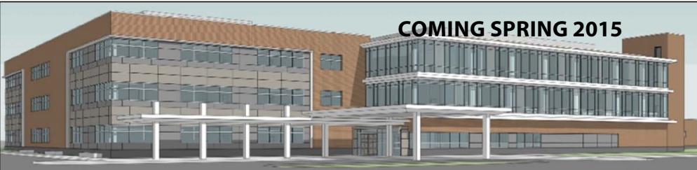
COMING SPRING 2015

New Home for WVU Family Medicine! UNIVERSITY TOWN CENTER