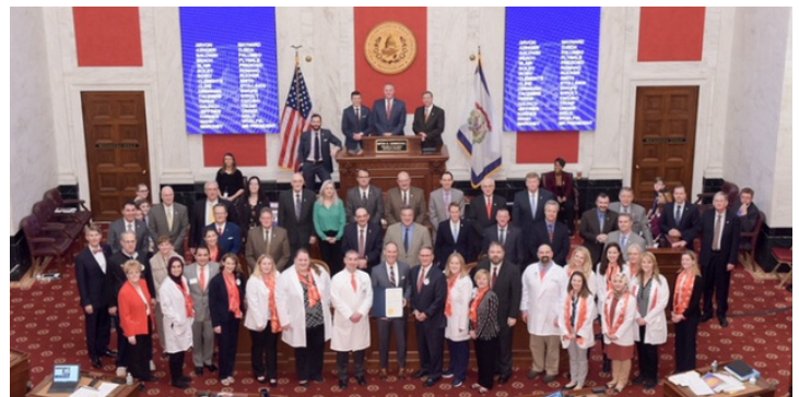
2018 Tiny Hearts Day at WV State Capitol